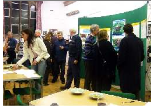
Open meeting in the village hall to validate the village plan (17 January)

The launch follows the validation of the plan by residents at an open meeting on 17 th January in the village hall (see photo). The Parish Council also gave its support to the document at the December 2008 meeting. The final version will now go off to the printers and every household will be then be supplied with a copy.