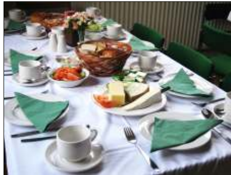
New crockery in use for the first time

At the end of January we were very pleased to see a successful completion to our Community Project to replace the crockery in Granby Village Hall, for use by all user groups.